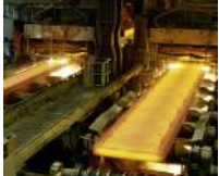
Metal Production and Processing