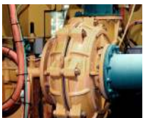
Fluid: Hydraulic pumps